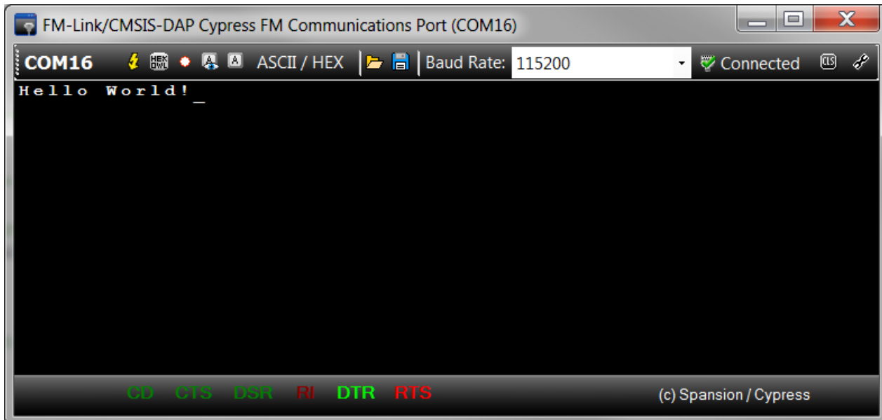
Figure 1: Characters echoed to Cypress Serial Port Viewer and Terminal

Use a terminal emulator, such as the Cypress Serial Port Viewer and Terminal, to connect to the kit. Be sure to set the baud rate to match the component and connect the program to the emulated serial port. Type characters into the emulator window and the kit echoes them back onto the screen.