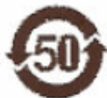
Figure 4 – Non RoHS Compliant